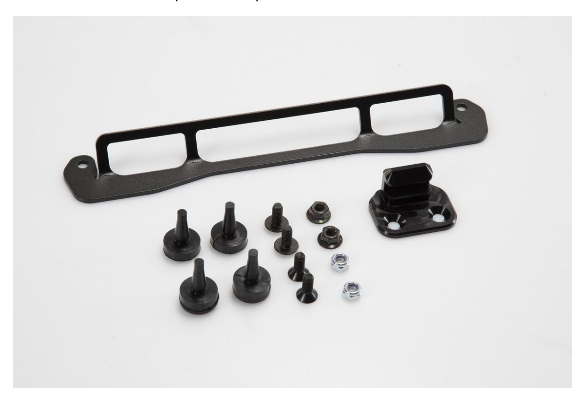
Adapter kit compatible with Shad Terra

Adapter kit compatible with Shad standard