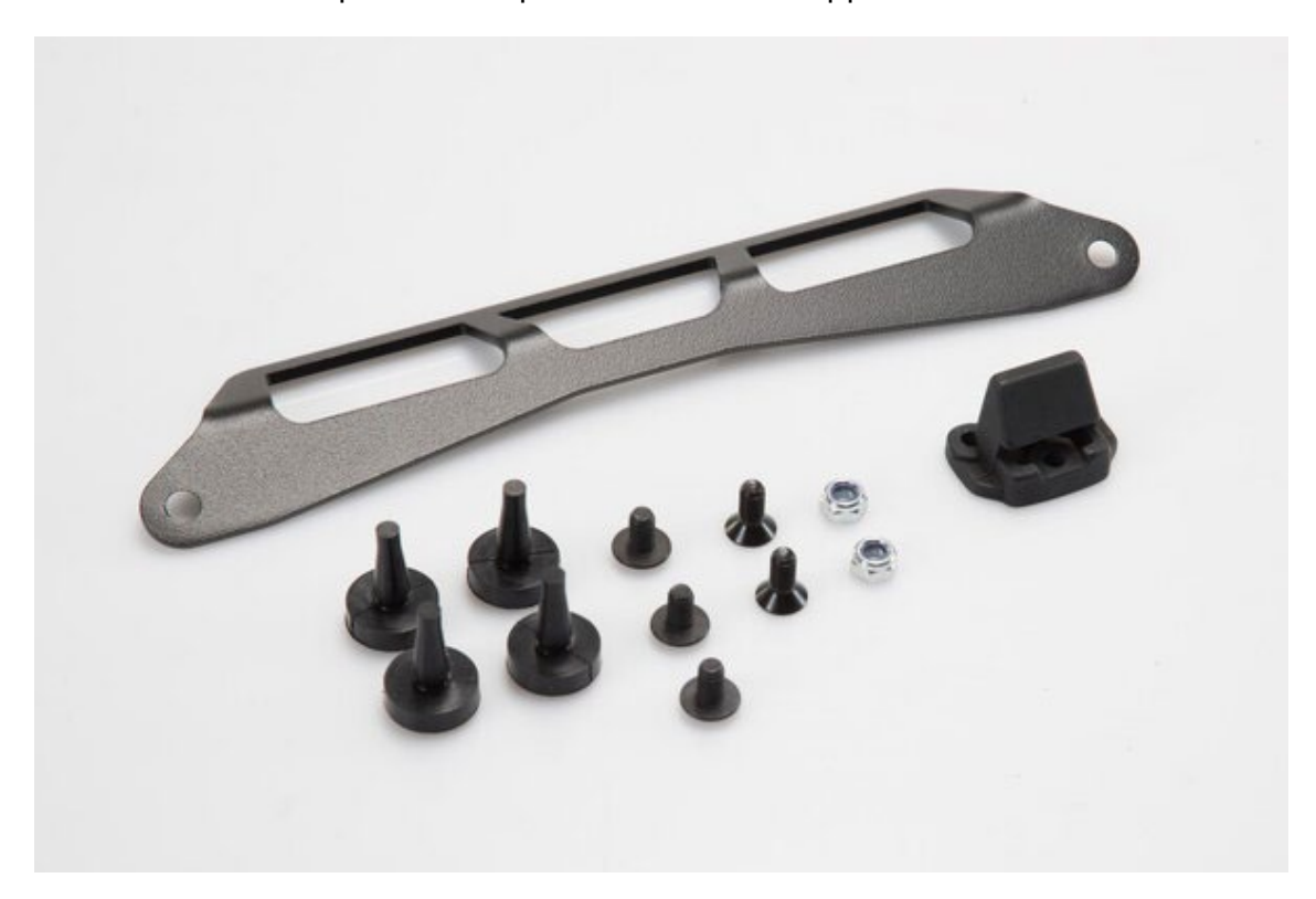
Adapter kit compatible with Givi / Kappa Monokey

Adapter kit compatible with Givi / Kappa Monolock